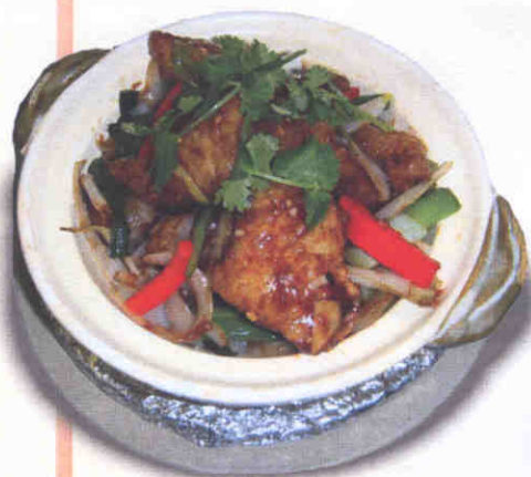
薑蔥炆班球煲 $9.50 Deep-fried Cod Slices Braised with Ginger, Onion and Green Onion