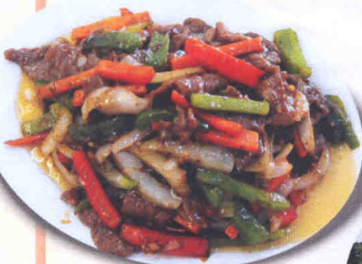
蜜椒牛柳條 $9.50 Honey Black Peppered Beef Steaks with Mushroom