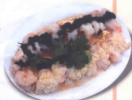
蒜蓉豆豉蒸蝦球 $10.50 Steamed Prawns with Black Bean Sauce and Garlic Sauce