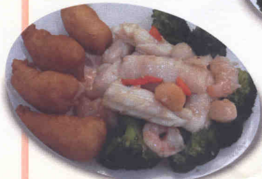
炸大蝦拼海中寶 $10.95 Harvest of the Seas