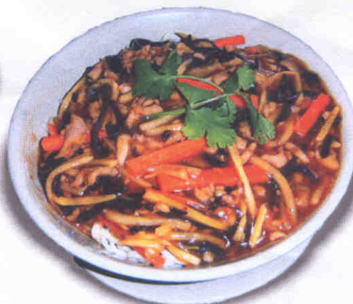
泰式甜酸雞絲撈上海幼麵 $5.95 Mixed Shanghai Thin Noodle with Shredded Chicken in Hot n' Sour and Sweet Sauce