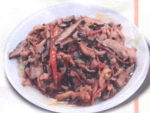
雞絲菇絲扒津白 $8.95 Braised SiuChoy with Shredded Chicken and Chinese Mushroom