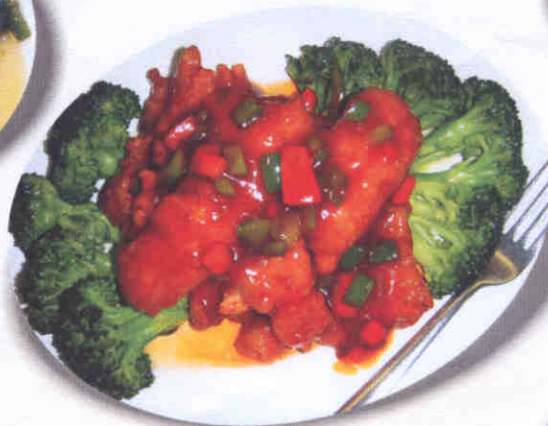
碧綠川汁石班塊 $8.95 Deep-fried Cod Slices with Broccoli in Spicy Bean Sauce